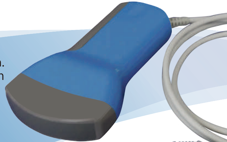
Convex Probe US-304AC

This original function provides you with new means for reviewing and receiving feedback after training. 'SyncView' will make it easier to check if you are scanning the correct area with the correct angle.