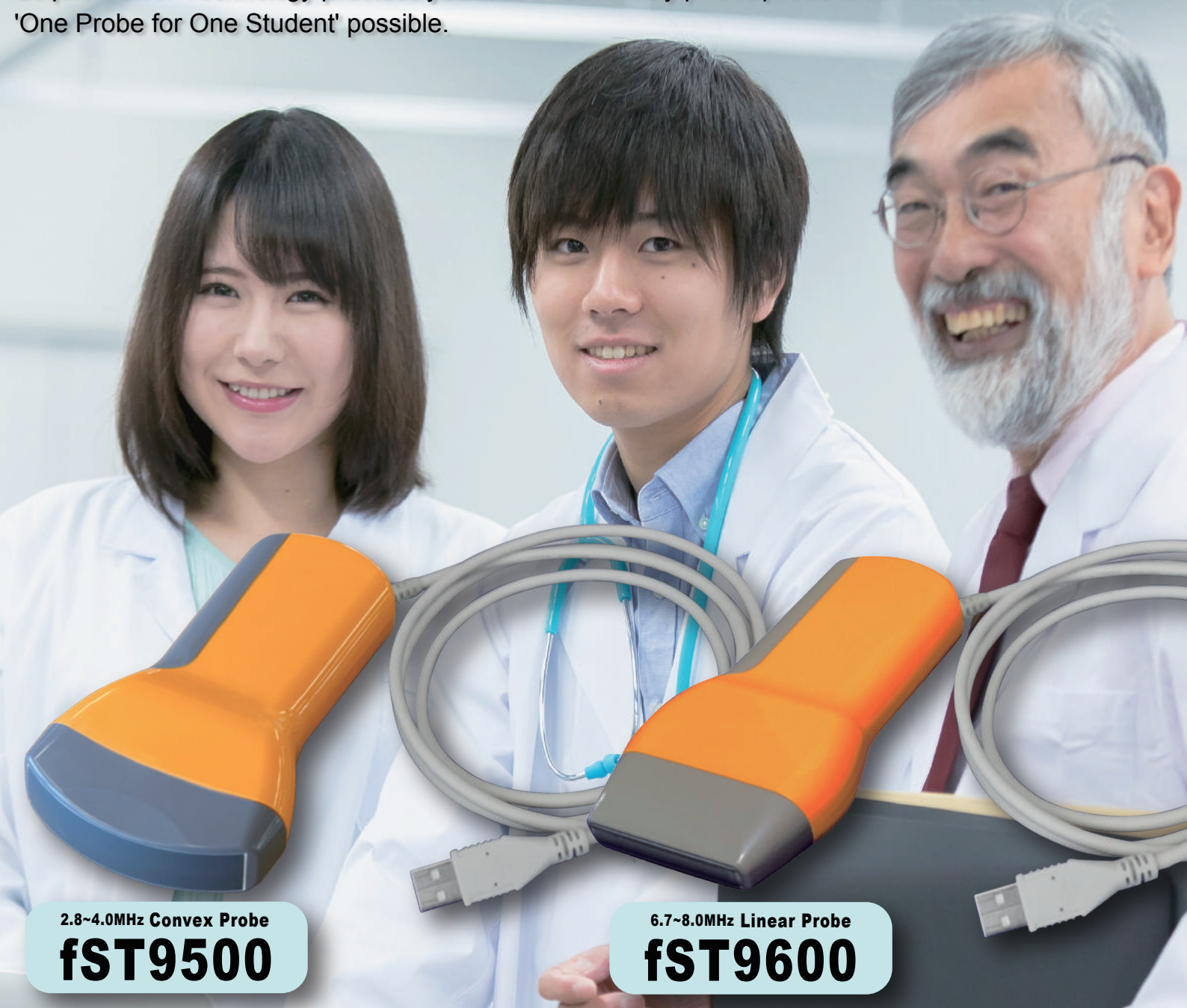
2.8~4.0MHz Convex Probe fST9500

Lequio Power Technology provides you with a reasonably priced probe which makes 'One Probe for One Student' possible.